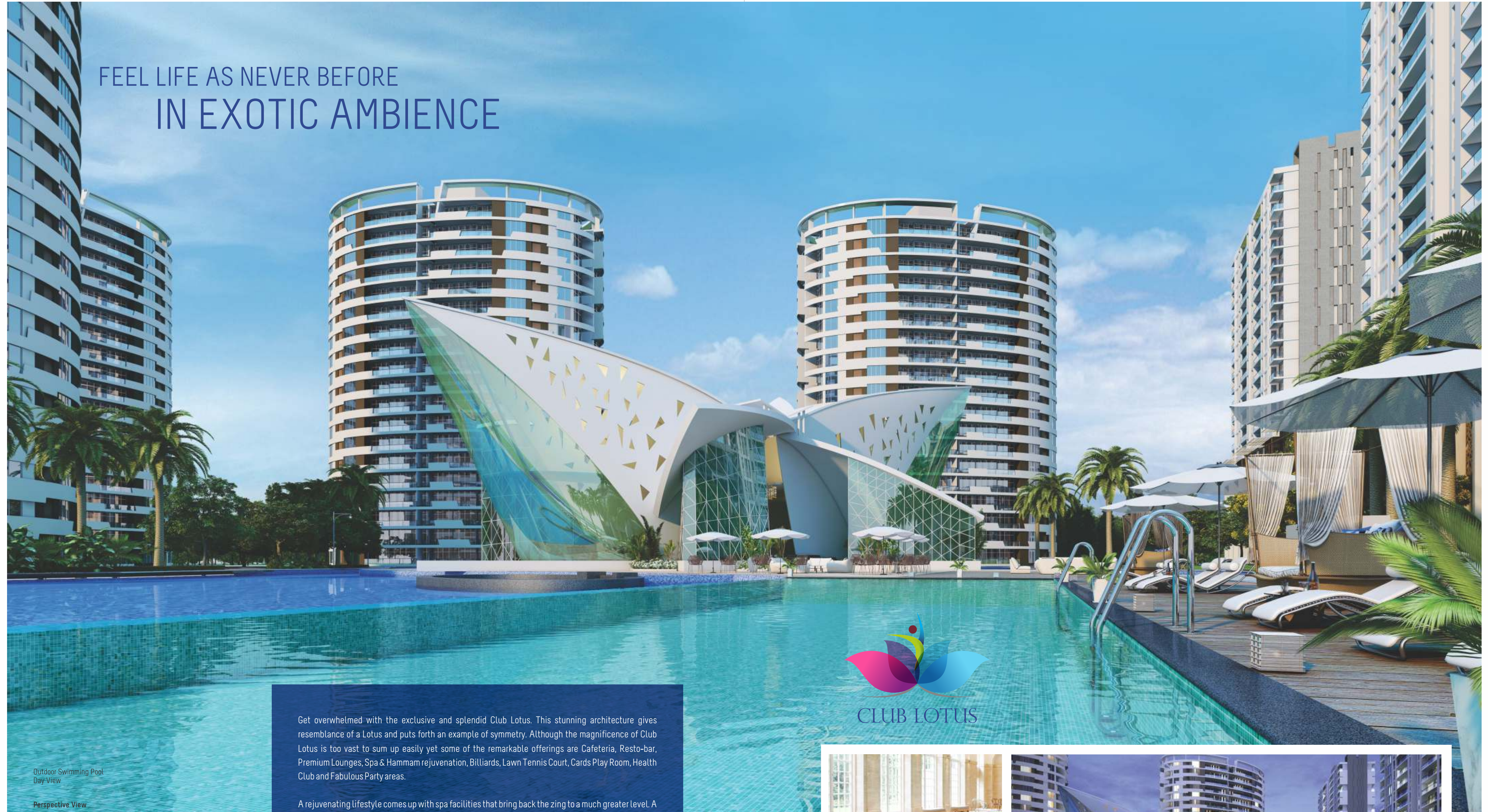
Outdoor Swimming Pool Day View