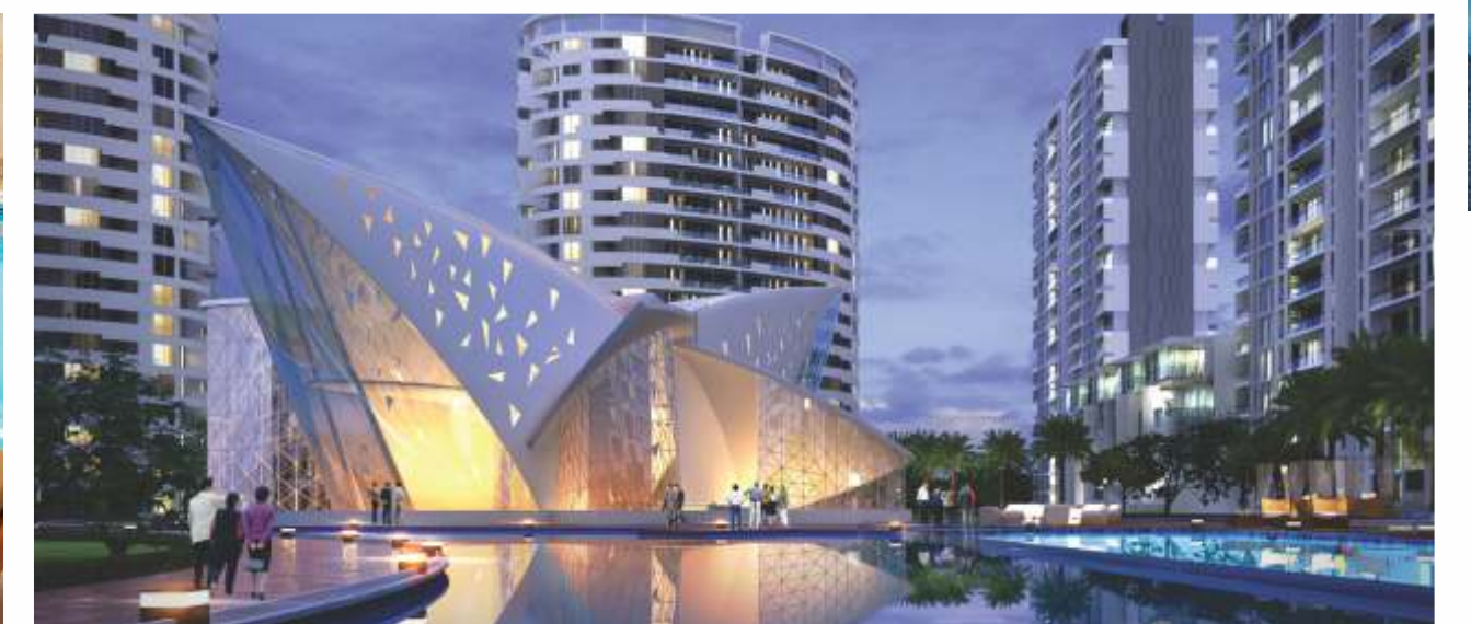
Outdoor Swimming Pool Evening View